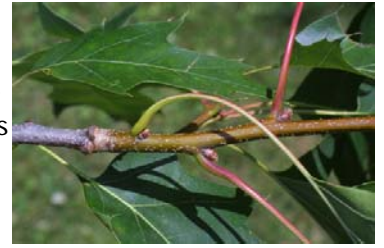
Twig of a Northern red oak

Tell the students to blow on the end of each twig, as if it were a straw. The red oak (but not the white oak) should produce bubbles on the other end, demonstrating different vascular structures.