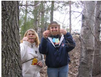
Stealing the scene at a Project Learning Tree (PLT) early childhood workshop.

Information on all workshops above can be found on www.mndnr.gov/plt