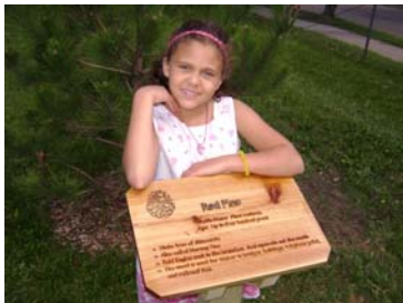
A winning GreenWorks! project at Northrup Urban School