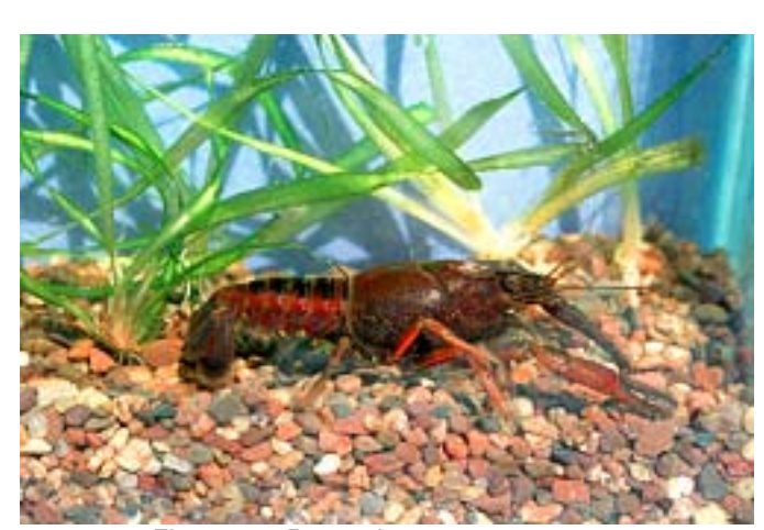
Figure 44. Procambarus acutus acutus.