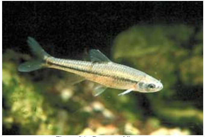
Figure 34. Pugnose Minnow.