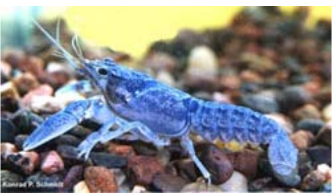
Figure 45. Blue Crayfish.