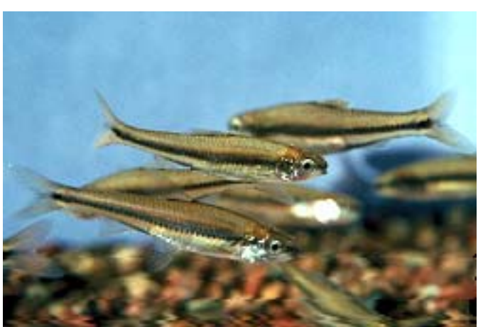
Figure 41. Weed Shiner.