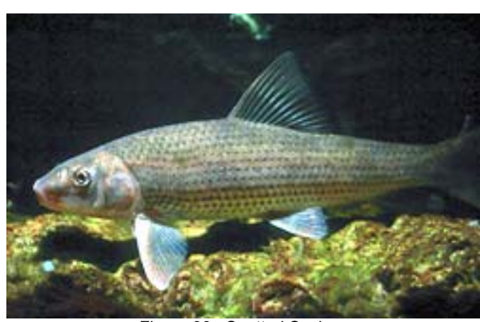
Figure 39. Spotted Sucker.