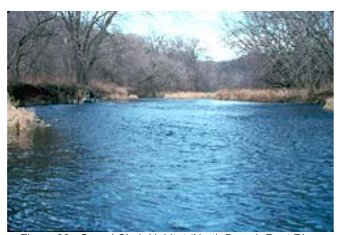
Figure 22. Gravel Chub Habitat (North Branch Root River upstream of Olmsted County Road 19).