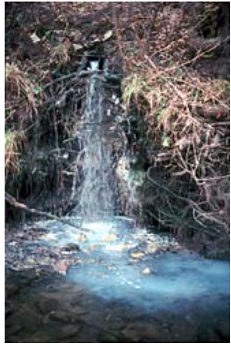
Figure 20. Creamery Outfall at Granger, MN.