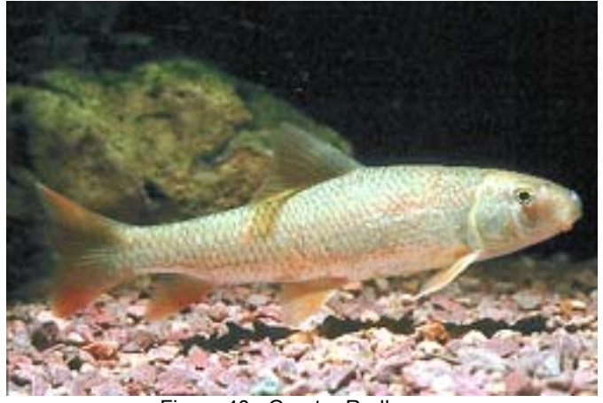
Figure 40. Greater Redhorse.