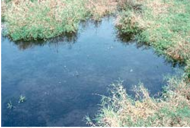
Figure 26. Least Darter Habitat (Otter Creek).