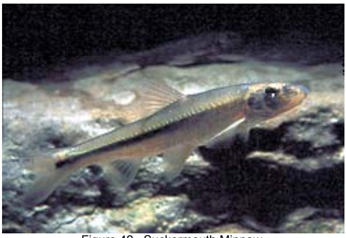
Figure 42. Suckermouth Minnow.