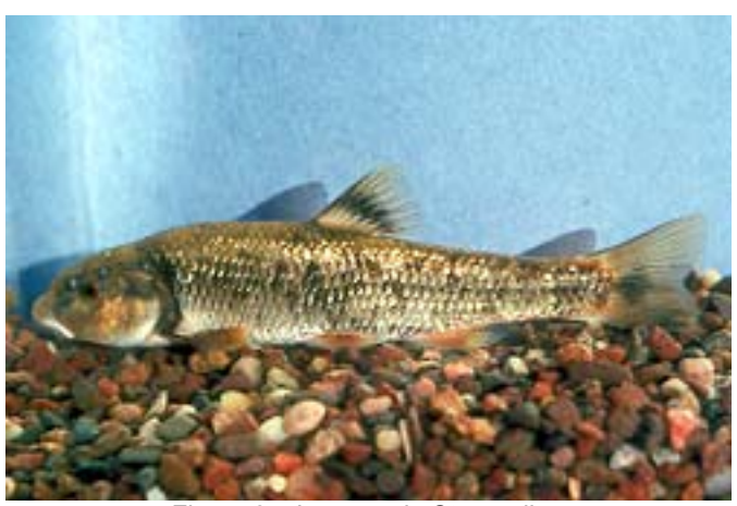
Figure 35. Largescale Stoneroller.