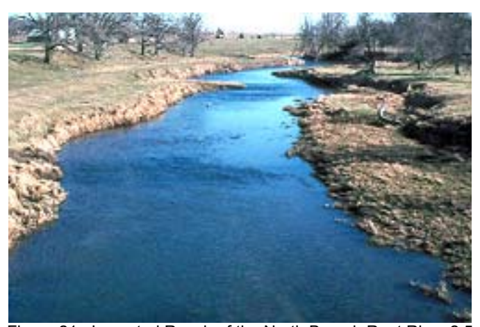
Figure 21. Impacted Reach of the North Branch Root River 2.5 Miles West of High Forest, MN.