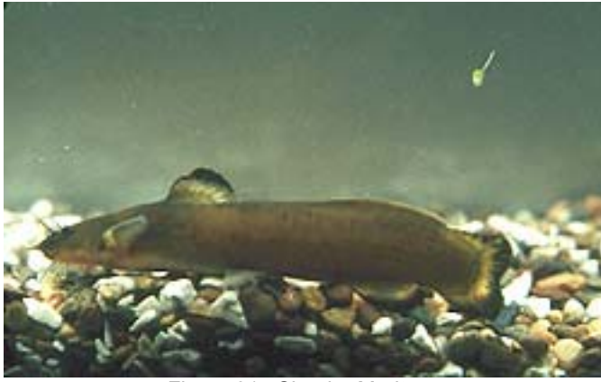
Figure 31. Slender Madtom.