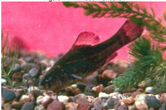
Figure 15. Pirate Perch.