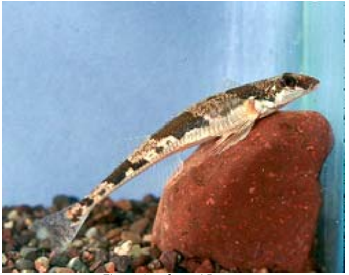
Figure 17. Crystal Darter.