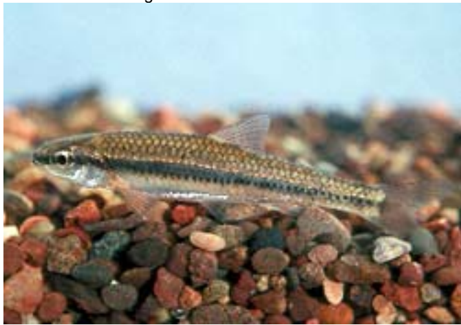
Figure 30. Ozark Minnow.