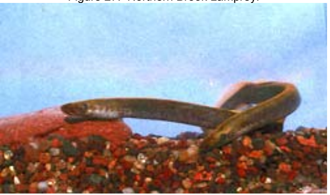
Figure 28. American Brook Lamprey.