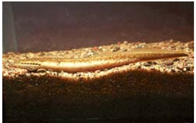
Figure 27. Northern Brook Lamprey.