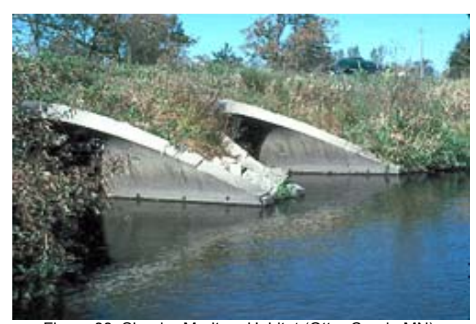
Figure 33. Slender Madtom Habitat (Otter Creek, MN).