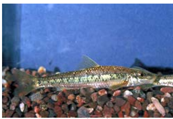
Figure 18. Gravel Chub.