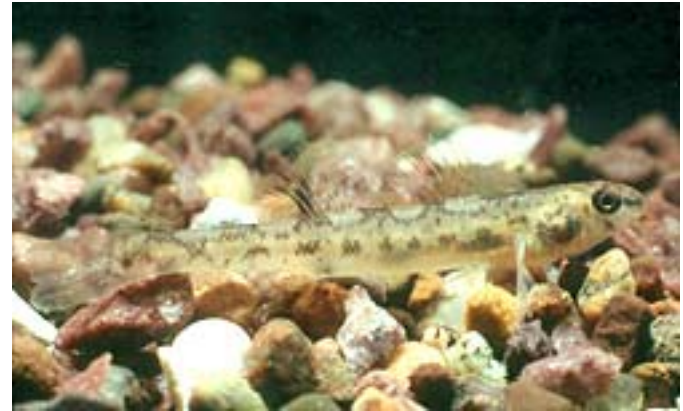
Figure 23. Bluntnose Darter.