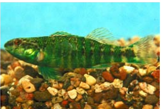
Figure 37. Banded Darter.