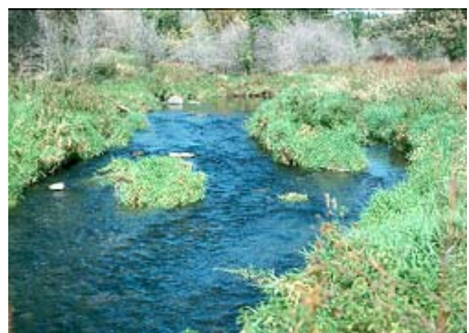
Figure 32. Slender Madtom Habitat (Otter Creek - Nelson Paradise Wildlife Area, IA).