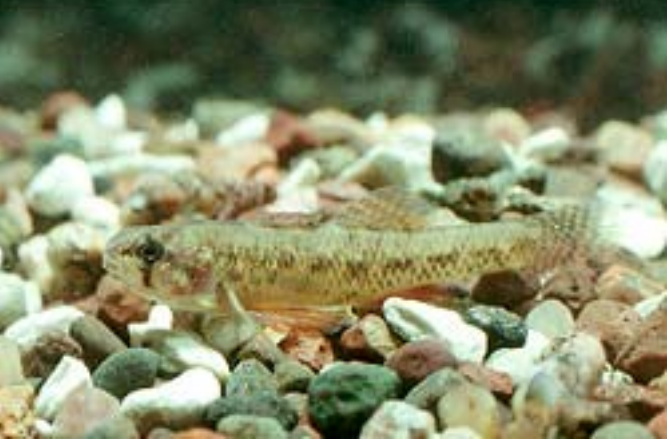
Figure 25. Least Darter.