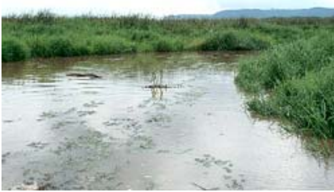
Figure 24. Bluntnose Darter Habitat (Pine Creek).