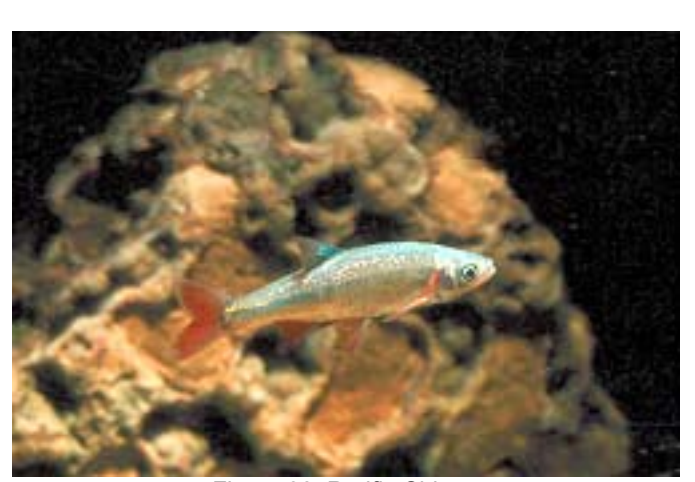
Figure 38. Redfin Shiner.