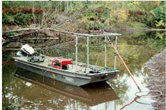
Figure 14. Miniboom Shocker.