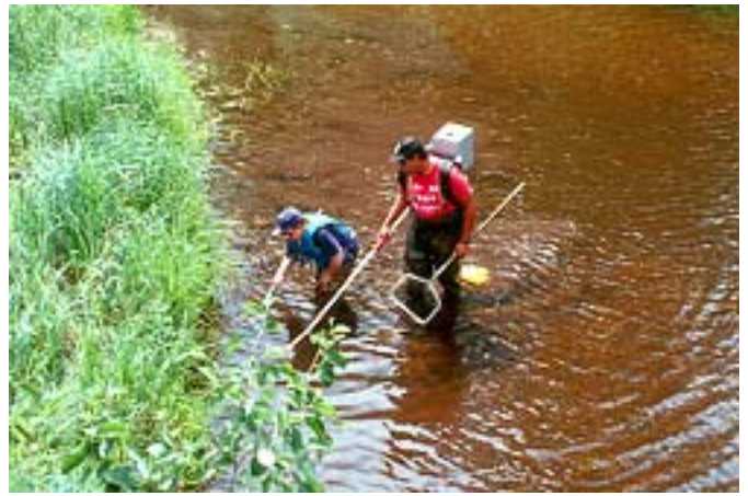
Figure 13. Backpack Shocker.