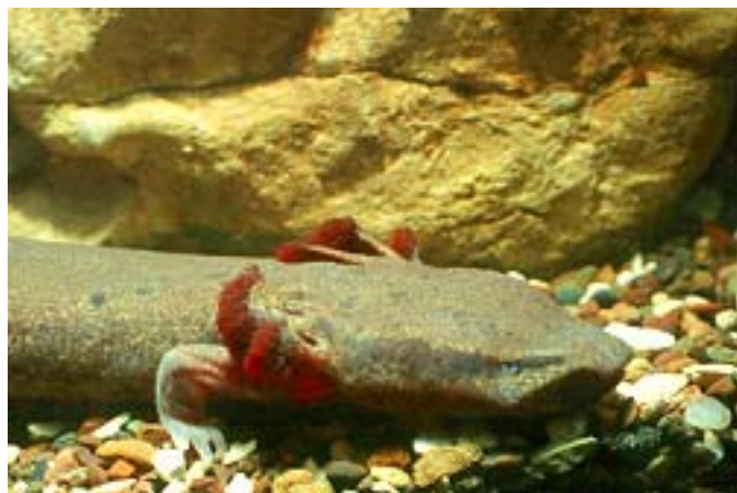
Figure 43. Mudpuppy.