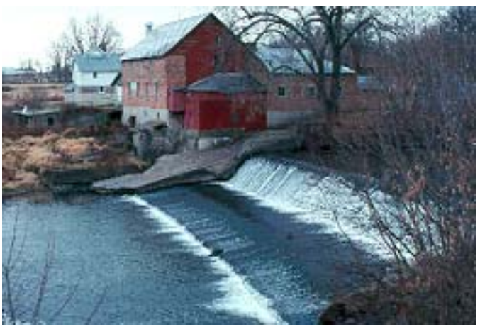
Figure 19. Lidtke Mill Dam (Fish Barrier).