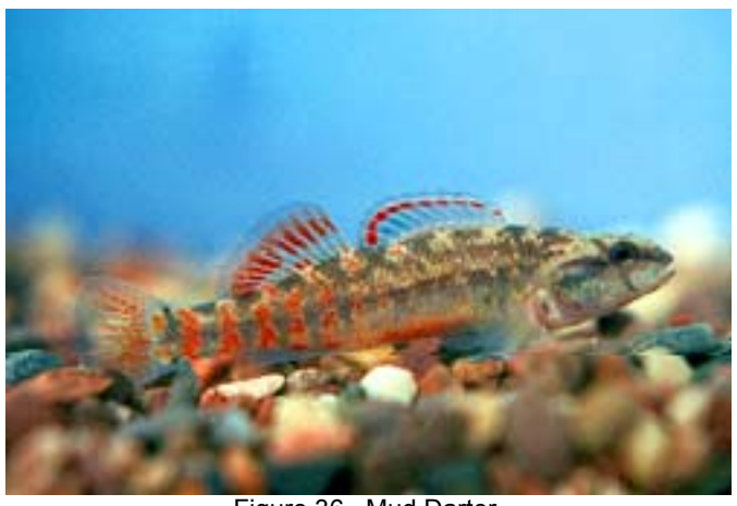
Figure 36. Mud Darter.