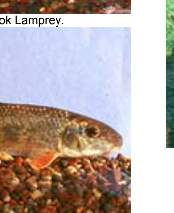
Figure 29. Black Redhorse.