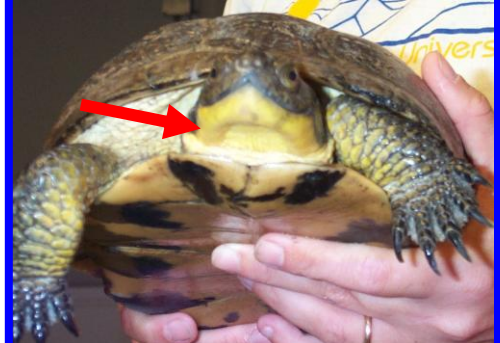
Yellow neck/chin; no stripes

Marshes, ponds, rivers & streams, adjacent uplands; Also travel overland & cross roads. May bask on logs, shore