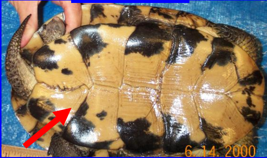
Male=concave Plastron Female=flat

Carapace (upper shell): Round, dome-shaped, very smooth, dull black with specks and streaks of yellow throughout.