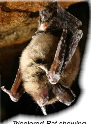
Tricolored Bat showing signs of the fungus linked to WNS