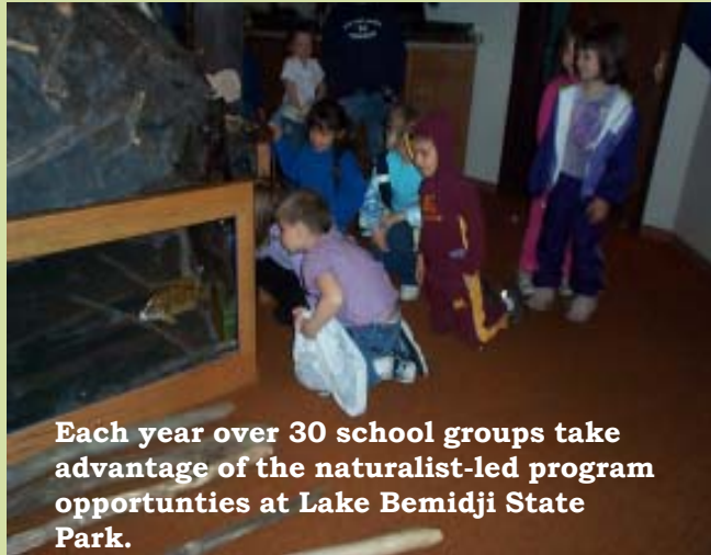
Each year over 30 school groups take advantage of the naturalist-led program opportunities at Lake Bemidji State Park.

Lake Bemidji State Park stands as an island within a growing community, reflecting the natural landscape. As natural forces shape the landscape, their pattern of change is preserved within the park. Lake Bemidji State Park has many firsthand experiences waiting for your classroom.