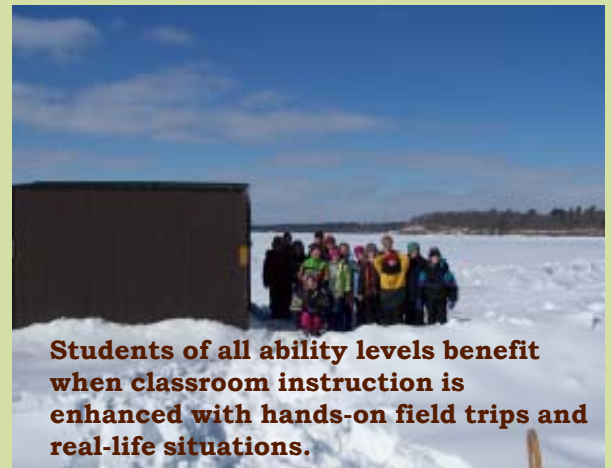
Students of all ability levels benefit when classroom instruction is enhanced with hands-on field trips and real-life situations.

The naturalist will team-teach with you to provide a unique opportunity that is only available through an outdoor experience.