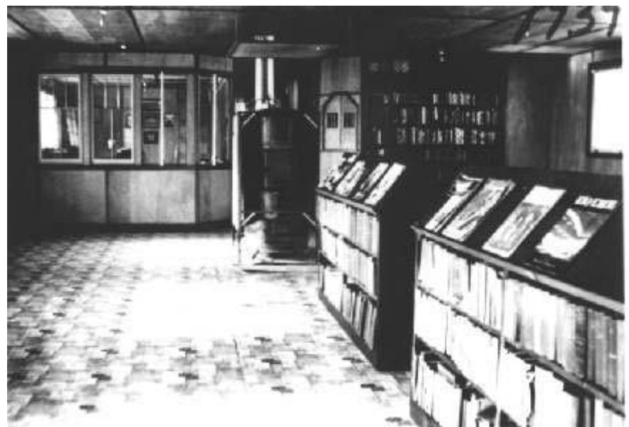
The Camp even had an education building called "Gooseberry Falls University."