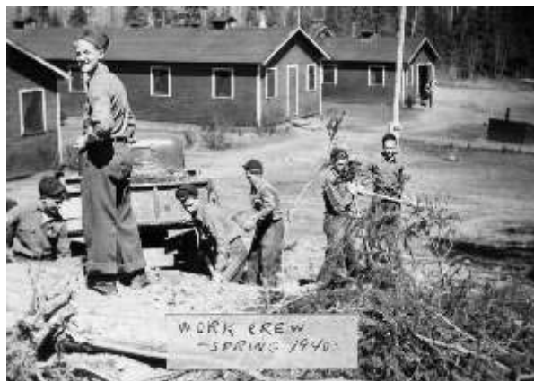
There was a hustling, bustling of activity as the “boys” built