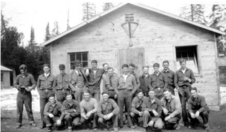
"Boys of Barrack #3"