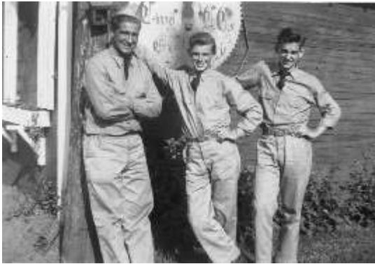
"Ready to ring the dinner bell"