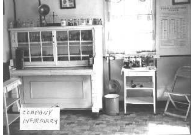
an infirmary (hospital), latrine (camp bathroom),