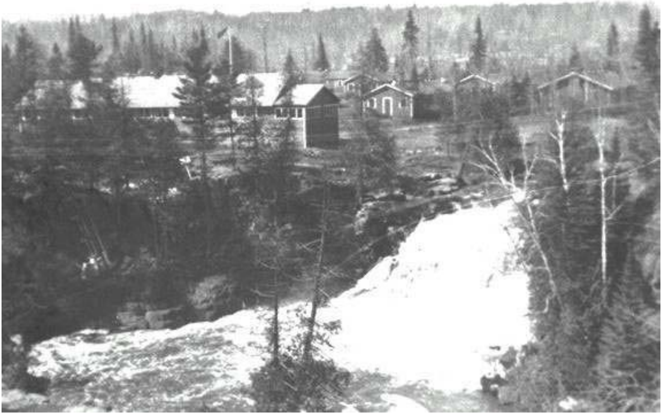
just behind the Upper Falls. A typical CCC Camp had 10 army style barracks,