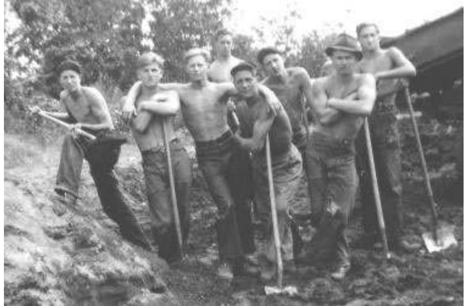
Large scale construction & development by the “CCC boys” began in 1935. By 1936 the park was considered “one of the more fully equipped in the state.”