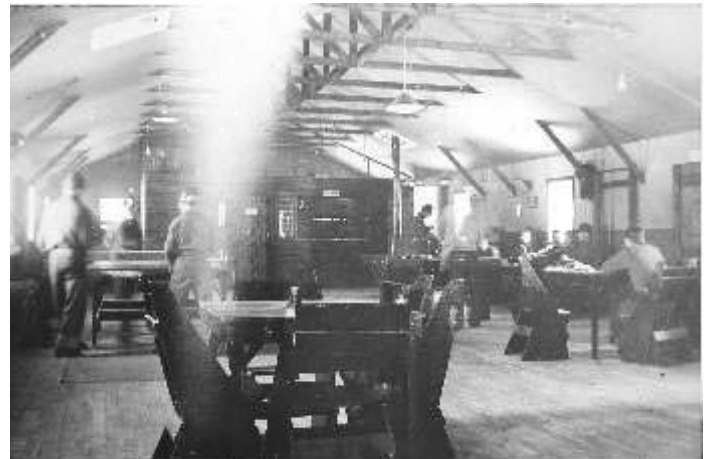
mess hall (lunch room), recreation hall,