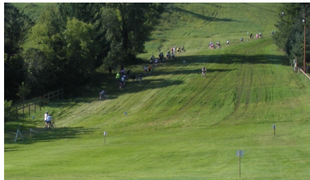
Riding bikes and running up an Alps hill

Thanks to everyone who helped make this event a fun time for all.