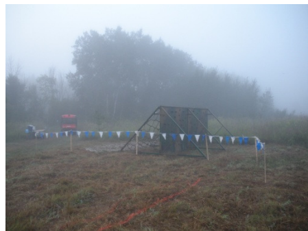
Obstacle in the park on race morning