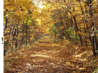
2008 Fall Colors

Leaves are beginning to change and fall from the trees. The first trees to show color at the park are aspens and cottonwoods with yellow and gold. You can also see the reds and oranges of the maples. Later there will be the dark red, brown and russet of the oaks. Although it changes every year, depending on the amount of sun, rain, and the temperature, the best time to see colors here is during October. The prairie grasses are at their finest then.