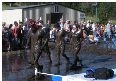
Surviving the mud crawl