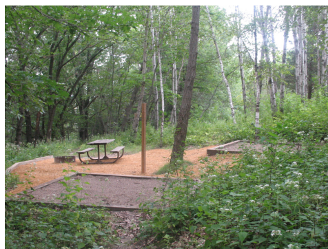
Campsite 3 Rehab

pads to display some farm equipment and removing buckthorn from the farmstead. David Saunders built and installed water bars on one of the trails in the campground. Nick Peterson rehabbed backpack campsite number 3 by installing water bars and a lantern post, installing timbers on the edge of the campsite and hauling lots of dirt and gravel