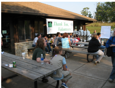
2008 Million Acorn Planting

If you've been at the park in the last couple of weeks, you will see that there are still some erosion problems from the recent heavy rains. If you or a group would like to volunteer, we have plenty of locations where work on the trails needs to take place. Also if you have any other ideas for structures you've seen or thought about, let us know.