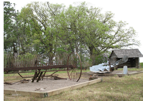
Oliver Charlie Project

Eagle Scouts have really been making a difference at Afton in the last couple of years. We have averaged about 4-7 projects a season. These projects are typically things that park staff would not normally get time to complete. We usually meet with the scouts 1-2 times before their actual work day. We review the project and determine any needed supplies and materials. Typically scouts are required to try and look for donations of materials. If they are unsuccessful, then the park usually pays for supplies from our park gift account. On the day of the project, a park staff member is usually around to ask questions of or to deliver supplies, but the Eagle Scout is the one in charge.