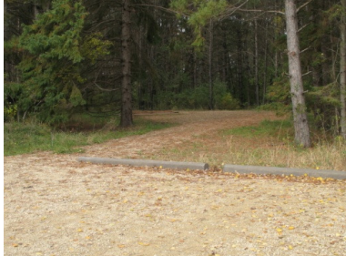
Cabin Site #3