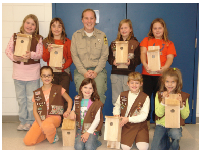
Girl Scout Troop 52658