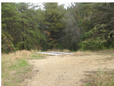
Cabin Site #1