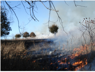
November 10 Prescribed Burn