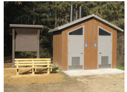
New kiosk and bench

Due to the incredibly mild weather, we were able to complete some of the latest burns ever at Afton. One burn took place on the west half of the campground, and the other burn was north of the snowshoe trail near the Afton Alps boundary line.