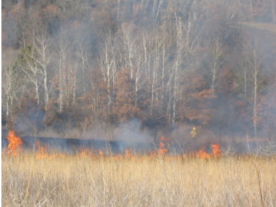
November 18 Prescribed Burn