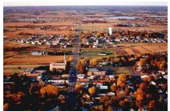
City of St. Michael.