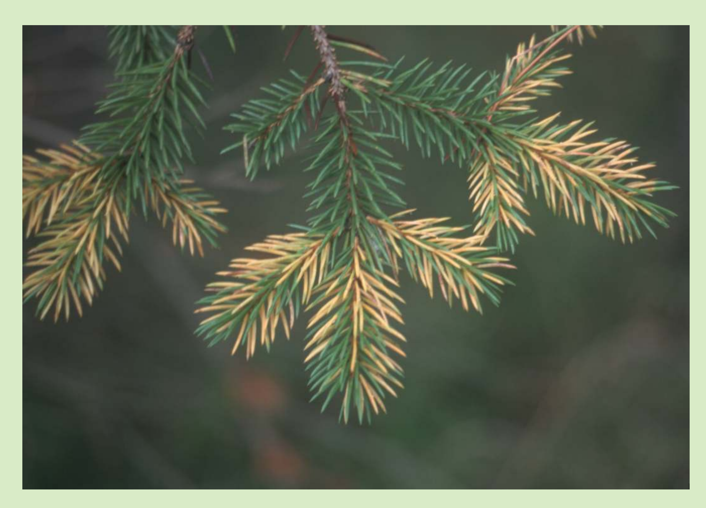
Fungus attacks current year needles