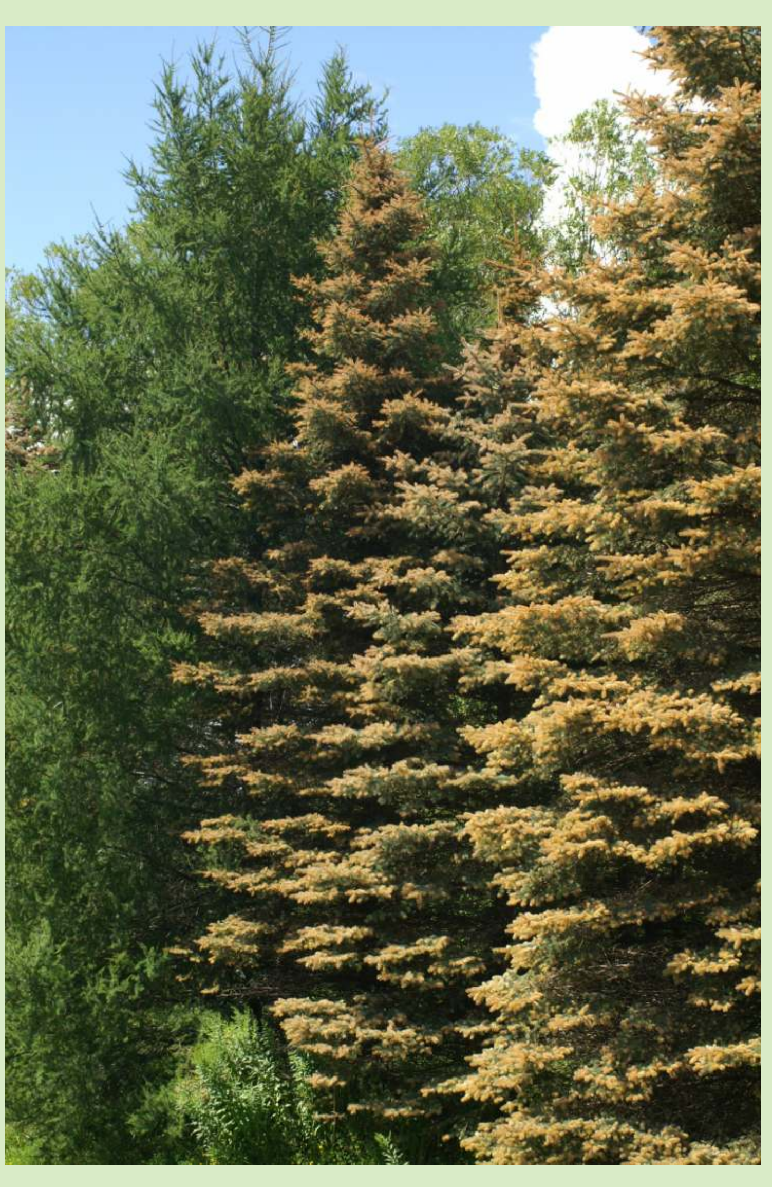
Yard trees affected by spruce needle rust