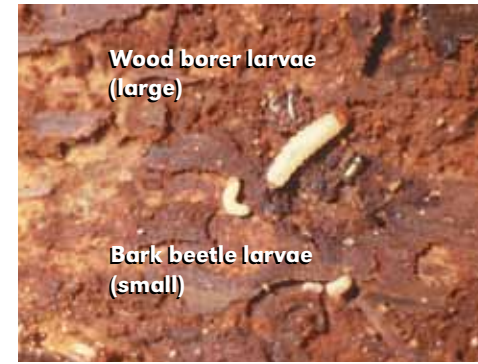
Since wood-borer eggs are laid singly in bark niches, there are no adult galleries.

Do not confuse bark beetle activity with wood borer activity. Wood borers tunnel under the bark first, then bore down into the wood. The larvae of wood borers only infest dead or nearly dead trees and are not a threat to nearby, living pines. Their tunnels are narrow at first, but may become 1/4-inch or more wide as the larvae grow. The boring material produced by wood borers is either very coarse and contains light colored wood splinters or is very fine, sawdust-like material that is packed in the tunnels. Full-grown wood borer larvae are 1-inch or more in length, cream colored, prominently segmented and either cylindrical or flattened.