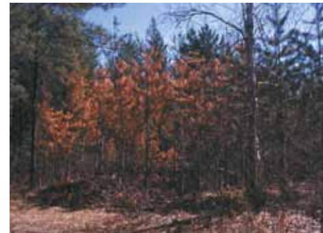
Breeding material near killed trees

please contact your local forester for advice because you may have a bark beetle population building up in your pines.