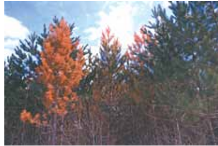
Dead and dying pines