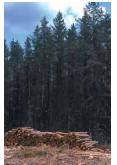
Remove cut products by June 1

Outbreaks are best prevented by maintaining healthy pine trees and by avoiding the creation of bark beetle breeding material (pine slash, cut pine products or injured pine trees). Tree vigor can be maintained by planting the correct species on each site, practicing timely sanitation, avoiding overcrowding by thinning, and, by watering and fertilizing where possible. Pines killed by bark beetles during the previous growing season pose no threat to nearby living trees since they do not contain viable bark beetles and are unsuitable for breeding sites. These trees do not have to be treated or removed for bark beetle purposes.