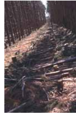
Thinned plantation with fresh slash is risky!