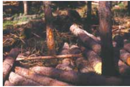
Wounded crop tree