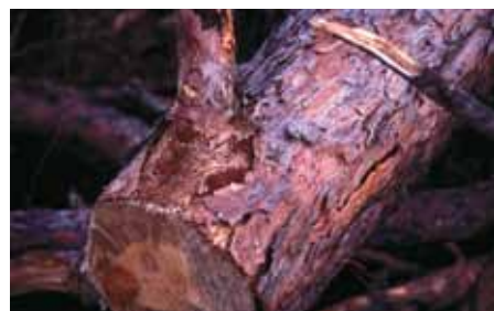
Exit holes in bark