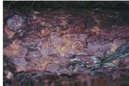
Sawdust piles near entry holes