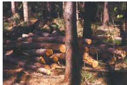
Logs shouldn't remain in stand after June 1