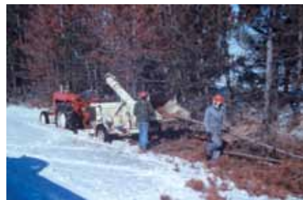
Chipping pine slash