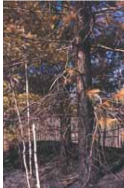
Fire scorched tree