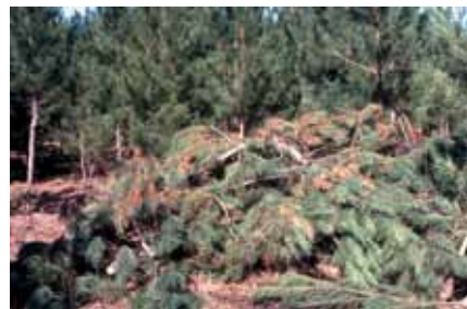
Slash piled for burning