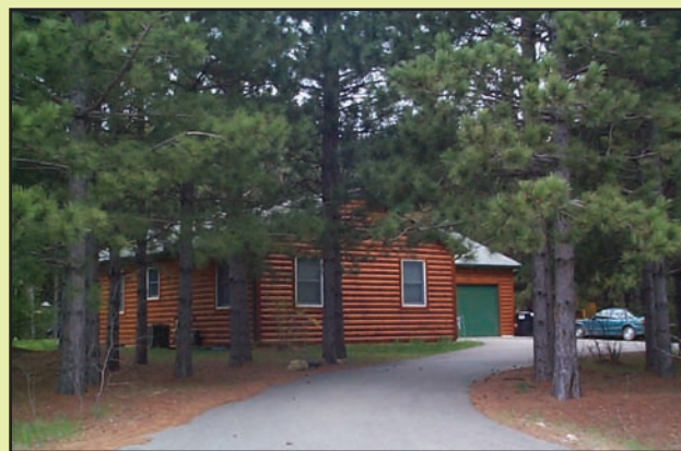
Log home in pines.