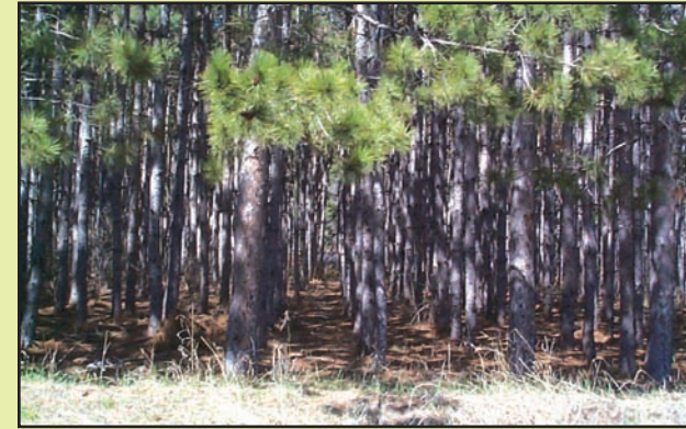
Pine rows need to be thinned.