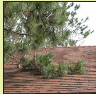
Trim all overhanging branches.