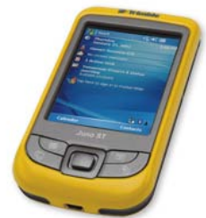
collecting invasive species data

The preferred method of data collection is electronic, using a GPS capable handheld computer or PDA using standardized forms in the field. For terrestrial invasive species, standardized forms have been developed, that can be utilized by both palm based PDA and handheld PC. Pendragon software is currently being used to develop electronic data forms and manage the terrestrial invasive species data. These forms are available to any staff wishing to survey for terrestrial invasive species. Specific information is recorded for each invasive population including location, date, observer, invasive species name, number of plants, plant distribution, acres of infestation, site type, and GPS coordinates.