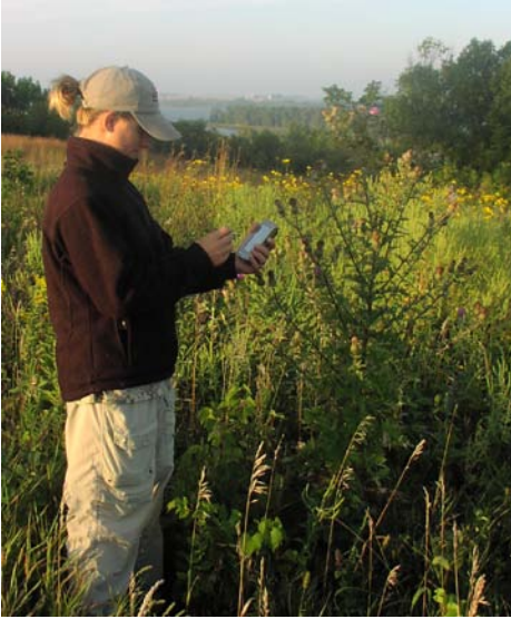
Figure 2. Mapping invasive species in the field.