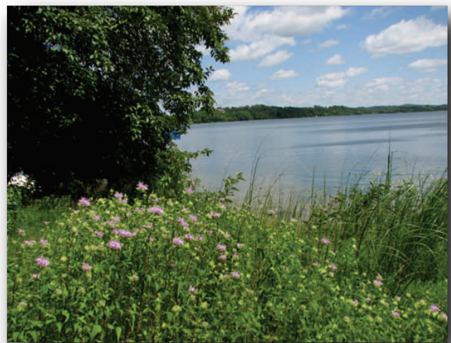
Before and after photos of a completed shoreland restoration