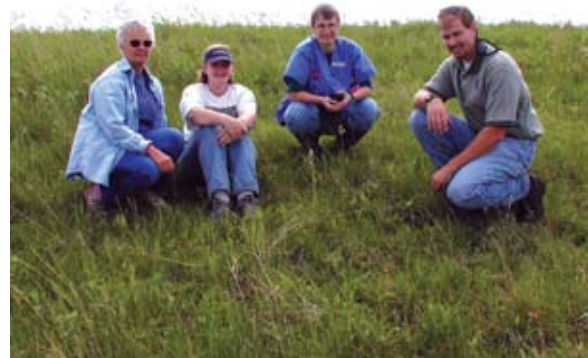
Prairie Landowners. Three generations of landowners and a DNR prairie specialist survey a protected Jackson County prairie.

Number of prairie stewardship plans and management projects. DNR plans to assist with at least 20 prairie stewardship plans and 50 management projects each year.