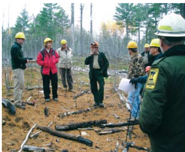
DNR staff and auditors discuss forest management practices and improvements during an annual forest certification audit.

DNR is a leader in forest certification. To date 4.8 million acres of state-administered lands have dual certification. DNR is also assisting private landowners in obtaining certification.