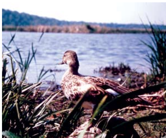
Minnesota has more than 1,433 public wildlife areas covering 1.3 million acres of habitat.

Acres protected in Wildlife Management Areas. DNR plans to add 8,000 acres to the WMA system each year during FY 2011-2012.