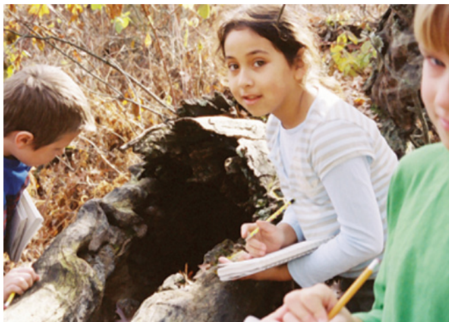
School Forest sites are used as outdoor classrooms where students—future stewards of Minnesota's natural resources—can explore and learn about the natural world.

Target: Maintain involvement in DNR forestry education initiatives to ensure a knowledgeable public. The School Forest Program will increase participating schools and support its existing 115 sites and 7,500 acres of land. Minnesota PLT will train at least 400 educators each year, with emphasis on early childhood workshops.