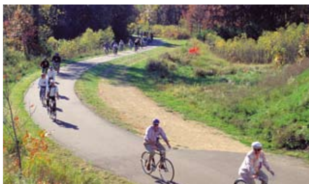
Outdoor education in Minnesota state parks creates a sense of stewardship for Minnesota’s natural and cultural heritage.

Each year, educational activities in Minnesota state parks reach more than 2 million visitors.