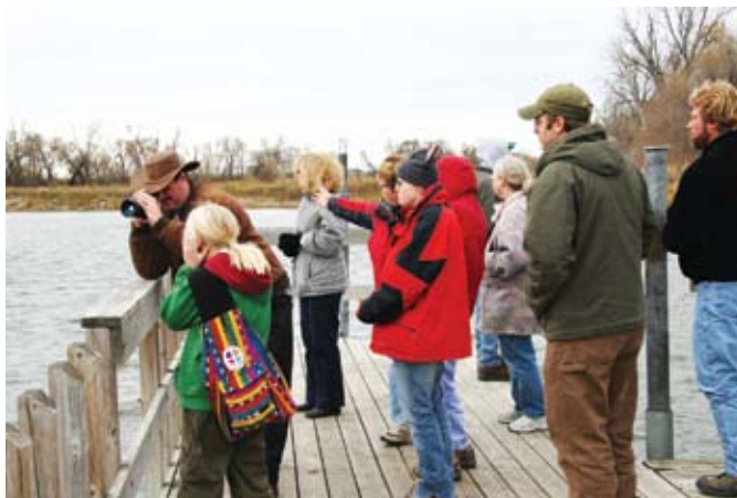
Master naturalist volunteers complete a 40-hour hands-on course. They study natural history, environmental interpretation, and conservation stewardship. This program is open to any adult who enjoys the outdoors.

TARGET: Train more than 1,000 master naturalist volunteers that provide 20,000 hours of service annually by 2015. To achieve this target, DNR and the University of Minnesota Extension will develop and conduct two main components: courses and curriculum for volunteer certification, and instructor training for resource professionals and professional naturalists to teach volunteer courses. The first course, Big Woods, Big Rivers, began in fall 2005. Prairies and Potholes began in 2006, and North Woods, Great Lakes started in 2009.