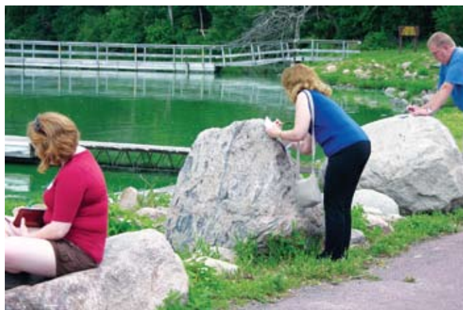
Teachers participate at a Project WET teacher workshop.

Number of participants involved in Minnesota Project WET Education Programs. The target is to maintain participation levels of at least 3200 people per year (2,700 students and 500 educators).