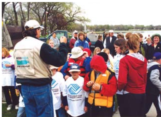
MinnAqua programs provide in-depth training and supportive materials for educators.