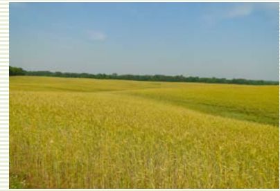
Cedar Creek Conservation Area, the golden vegetation (rye) is transitional annual cover to be being converted to a more diverse ecotypes in the spring of 2012.