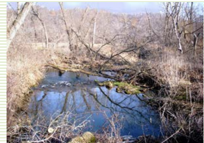
A before (above) and after(below) photo of Hay Creek, provided by Trout Unlimited, is taken before and after seeding, mulching and placement of erosion control blanket in 2010.